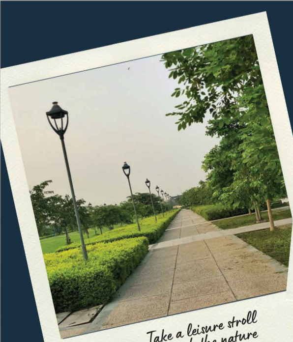
Take a leisure stroll through the nature clad campus