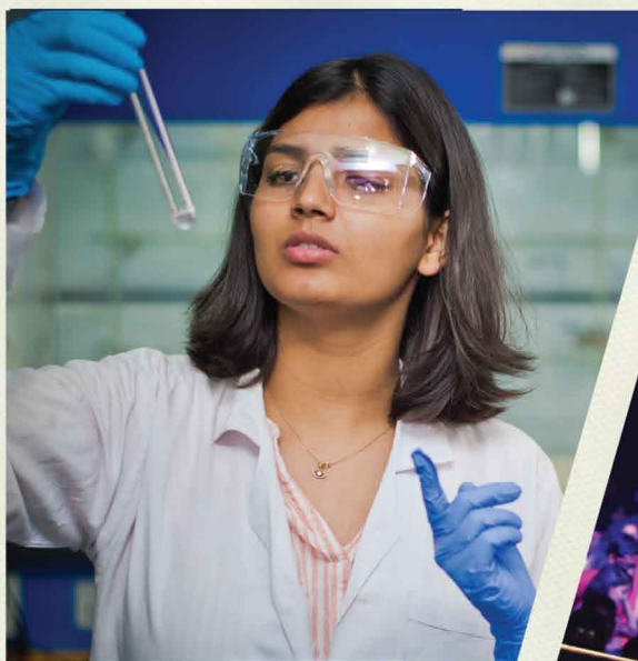
Academic life is always a buzz all over the campus at any given point