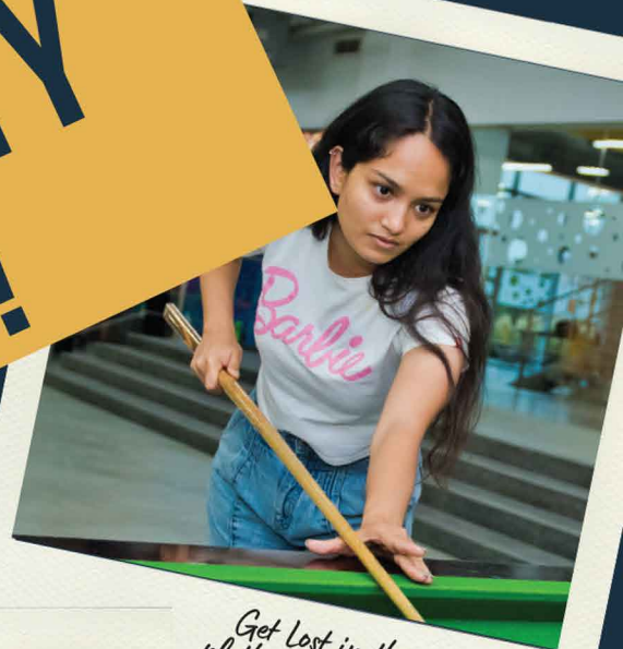
Get lost in the plethora of books in our Central Library