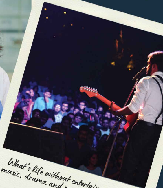
What's life without entertainment music, drama and so much more...