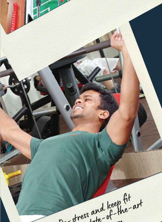
De-stress and keep fit with our state-of-the-art gymnasium