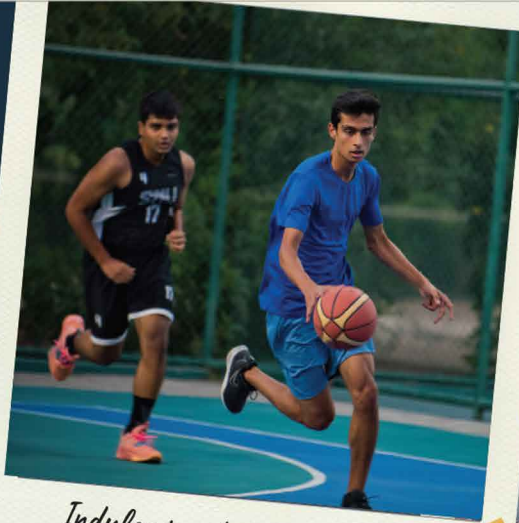
Indulge in adrenaline pumping sport activities